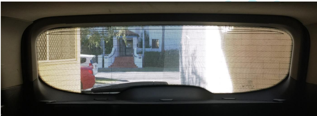
Image 2 - AutoVue and CurvaLam on Ford Kuga Two Weeks After Install - OPTICALLY CLEAR